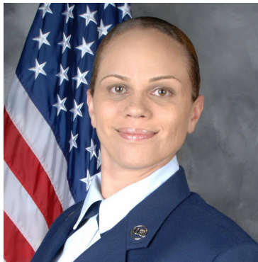
Aja Smith United States Congress District 41 Aja Smith