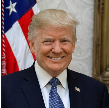
President Donald Trump United States President Donald Trump