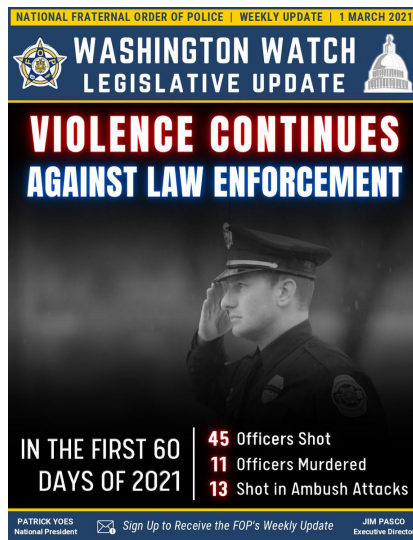
Washington Watch 3/1/21