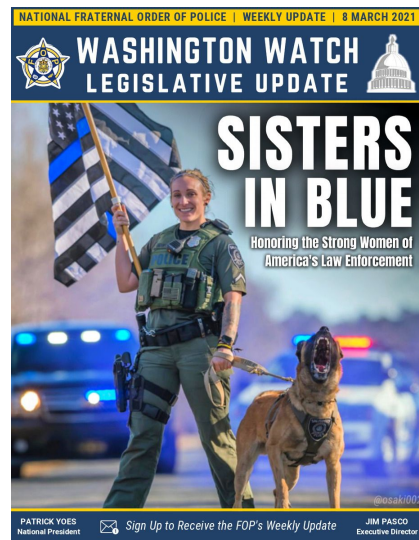
Washington Watch 3/8/21